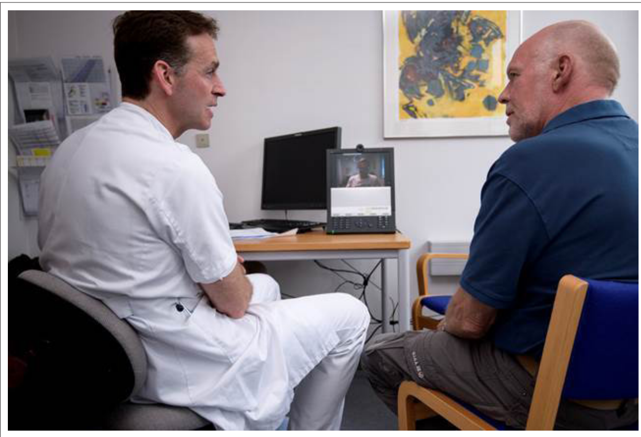
Figure 2 Picture of the video consultation with the patient at the hospital, together with the oncologist. The GP is taking part in the consultation by means of video from his clinic located in the rural region (picture-in-picture feature is turned off in this picture). Reprinted with permission from the Danish Medical Journal, photographer Palle Peter Skov.

saturation point may be reached. Therefore, at this point it was decided to stop the inclusion of data. By random, it ended with a consecutive sample.