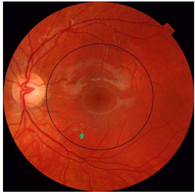
FIGURE 1. Forty-five-degree color fundus photograph of an 11-year-old participant from the CCC2000 Eye Study. A circle (black) centered on the fovea with a radius stretching to the temporal rim of the optic disc was used to define the macular area. In this case a bright fundus element of greatest linear dimension larger than 63 μm is seen (green arrow). It is the only example of a drusen-like element larger than 63 μm in the present study. Other bright areas seen in this photograph are fundus reflexes.

Spectral-domain optical coherence tomography (OCT, Spectralis HRA-OCT; Heidelberg Engineering, Heidelberg, Germany) was made with emphasis on enhanced-depth imaging mode scans. The protocol included a seven-line horizontal pattern and a four-line radial pattern, both centered