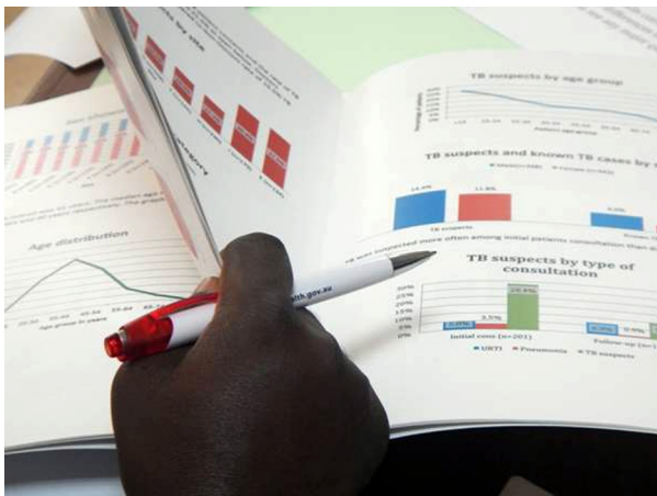
Fig. 1. Feedback report.

Based on the results of the first audit, performance feedback was developed for each of the healthcare providers. This included a feedback report where the results from the first audit were summarized in words, tables, and diagrams focusing on the healthcare providers' overall practice for suspecting tuberculosis and referral of tuberculosis suspects for further investigations (Fig. 1). Moreover, a personal feedback sheet was developed for each participant to enable the individual participant to compare their own results with those of their peers. The feedback report and personal feedback