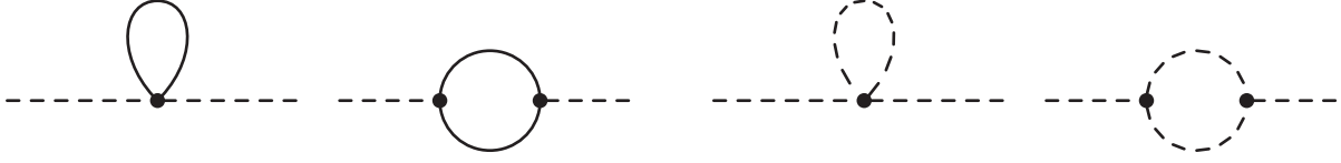
FIG. 2. Loop diagrams contributing (at next-to-leading order) to the scalar mass. The solid lines are pions and the dashed lines are scalars.

with the coefficients c_i listed in Table I. To renormalize the scalar mass we choose the values of \Gamma_i^K listed below and stress that they only depend on the number of pions n_\pi but no other specific detail of the given breaking pattern.