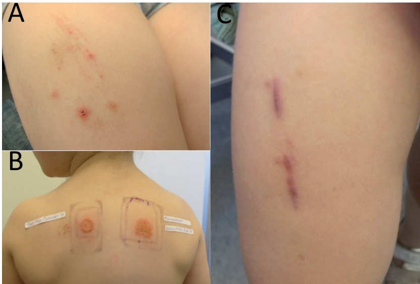
Fig. 2. Clinical signs of persistent skin reactions and aluminium hypersensitivity. (A) Excoriations, hyperpigmentation, hypertrichosis and eczema on the lateral thigh. (B) Patch-test showing positive reaction (+++) on the 4 th day to an empty Finn Chamber (left) and to aluminium chloride hexahydrate 2% (right). C. Two scars on the left thigh of a 3-year-old child after surgical removal of 3 itching nodules.

from their skin lesions and 2 patients had the nodules surgically removed. One skin biopsy showed fibrosis and the other 3 biopsies showed chronic inflammation.