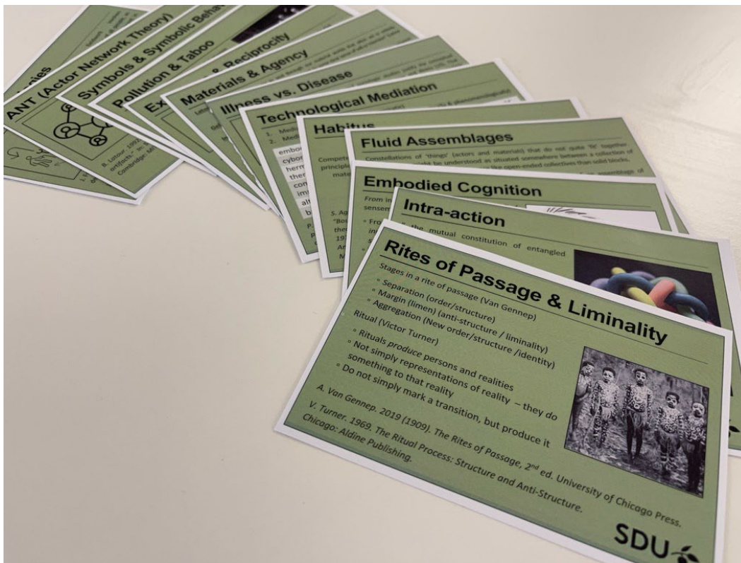
Figure 3: The deck of theory cards used in a participatory research workshop to encourage perspective shifts on qualitative field material consisting of a large number of self-recorded user videos.

The co-analysis process consisted of starting with selections of user data and/or salient insights emerging from the UX practitioners’ field research, then picking 1-3 theory cards to discuss what these particular perspectives would let us see in that material, and what additional questions they would inspire in continuing field research.