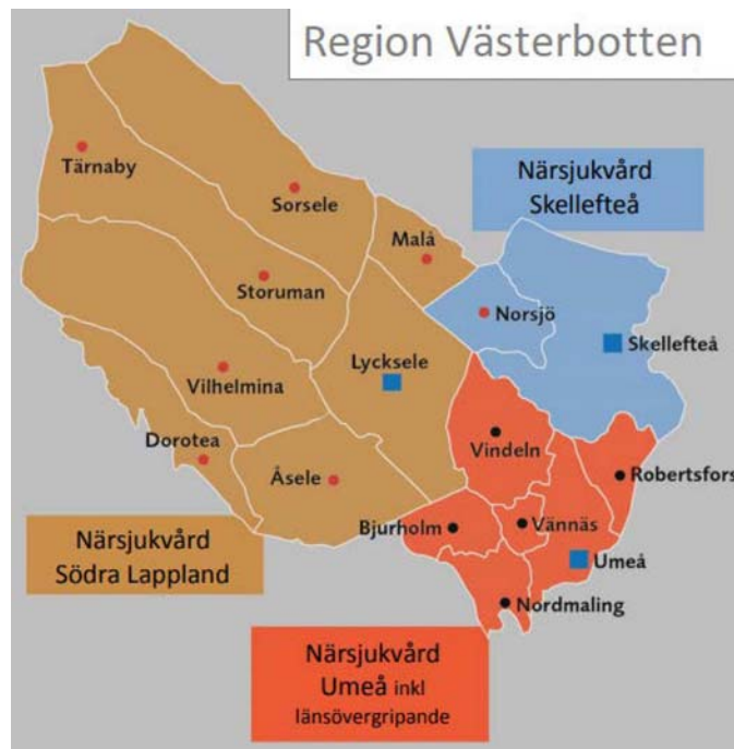
Figure 2: Map of the municipalities in Västerbotten divided into healthcare regions. Cottage hospitals are located in Tärnaby, Sorsele, Storuman, Malå, Vilhelmina, Dorotea and Åsele. Hospitals are located in Lycksele, Skellefteå and Umeå.