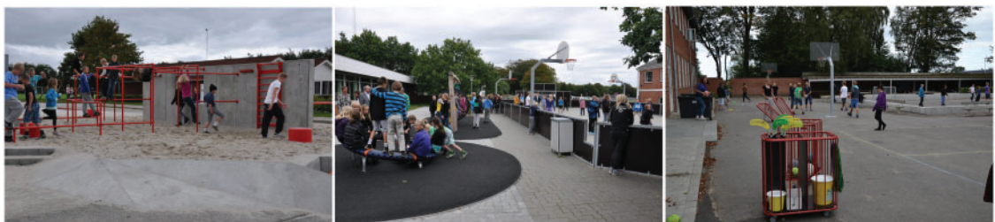
Fig. 1. Examples of the physical environment changes and the provision of unfixed equipment from three of the seven intervention schools.

The intervention consisted of 11 components targeting the physical and organizational environment at the schools in three main areas: (i) after school fitness program, (ii) active school transport and (iii) recess PA. The intervention components targeting