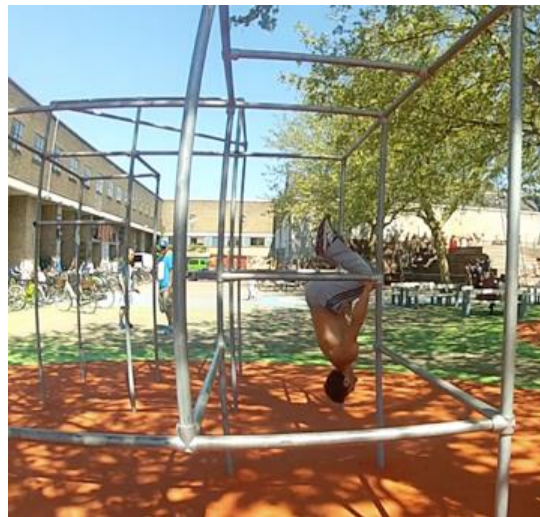
Figure 6. The practitioner Ilir performing repetitions on a rail.

Saville (2008, p. 900) has highlighted the role of trying again and again, 'through which the kinetic play of bodies in space are bringing about something new.' Based on our study, however, it appears that the description of trying must be complemented with descriptions of effort, as well as a refined understanding of repetition. In fact, only through a proper understanding of repetition is it possible to understand the experienced meaning and value of making an effort. Just as muscles can develop a higher level of strength after heavy strains if they have time to recover (c.f. the principle of supercompensation), good bodily habits can grow through repeated challenges (Aggerholm, 2015b, pp. 179-184). Learning new tricks in parkour is a good example of this. It involves an active process of practising through which the habitual comportment can be refined and expanded. Practitioners in parkour incarnate this active and bodily self-formation through repetition. Thus, they can be interpreted to represent acrobatic existence, which 'de-trivializes life by placing repetition in the service of the unrepeatable.' (Sloterdijk, 2013, p. 207)