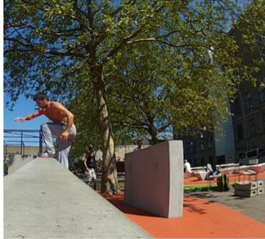
Figure 2. The practitioner Ilir working with a challenge.

The figure can also be an image of a particular move that they are not yet able to do. In this situation the practitioner (Ilir) jumps over the first wall and tries to land on the second one with both feet. He is perfectly able to reach the wall, but he keeps splitting his legs and lands in a more secure position with one of his feet pushing on the side of the wall. He tries over and over again, but can't stop splitting his feet. He gets very frustrated. 'I don't understand it. I can't get that foot up', he notes. This can illustrate how practitioners in parkour express a way of moving in relation to challenges, which can be described as movement on the borderline between what is possible and not yet possible; between 'I can' and 'I cannot'. Such challenging movements resemble a basic feature of acrobatics, which Sloterdijk (2013, p. 123) argues to be 'a doctrine of the processual incorporation of the nearly impossible.'