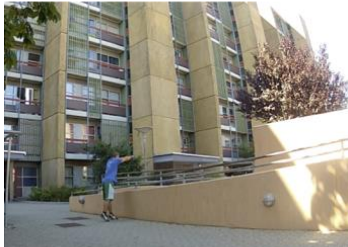
Figure 7. The practitioner Ilir performing repetitions on a rail.

An intersubjective dimension of overcoming challenges involves making use of other practitioners as examples and models. One aspect of this is when practitioners actively engage in each others' challenges - and help each other overcome the obstacles by showing an example.