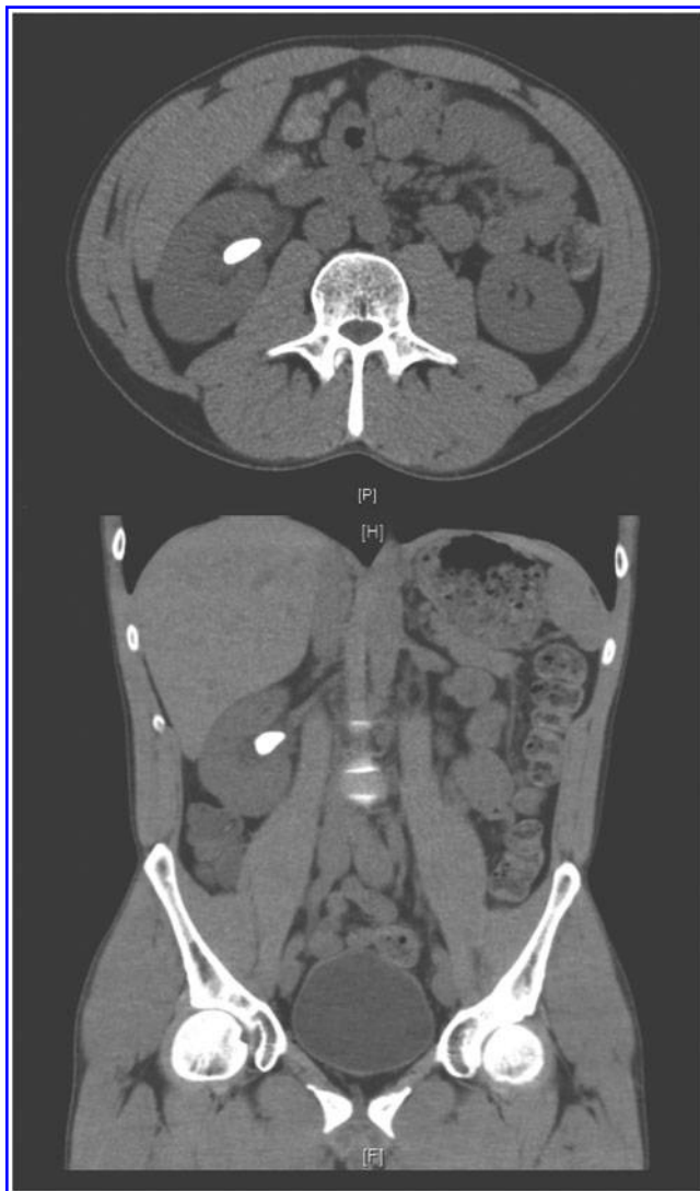
FIG. 1. Preoperative CT abdomen/pelvis (renal stone protocol).

CT abdomen/pelvis without contrast (renal calculus protocol) was done and demonstrated a 2 cm nonobstructing stone in the right renal pelvis (Fig. 1). The average Hounsfield unit value was noted to be 825. The patient was scheduled to undergo right percutaneous nephrolithotomy (PCNL) within 2 weeks of presentation.