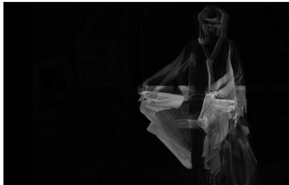
Figure 2: Graphically reworked representation of the experiment with tactile sensing of textiles.

The aim of the research was to develop new dialogue tools for teaching fashion and textile students with the ultimate goal of creating value by stimulating new ways of thinking and engaging with users. The long-term aim was to develop alternative transformational strategies that may promote the design of products and services for a more sustainable future.